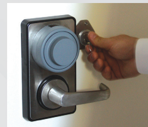
Using Key Override

Leave the combination lock in the open position. (The lock bolt for the combination lock is within the LKM10K and is not the latch that can be seen from outside the lock).