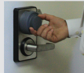
Shown with the Kaba Mas X10

Note: See the manufacturers' operating/programming instructions for dialing procedures and programming features for the combination lock.